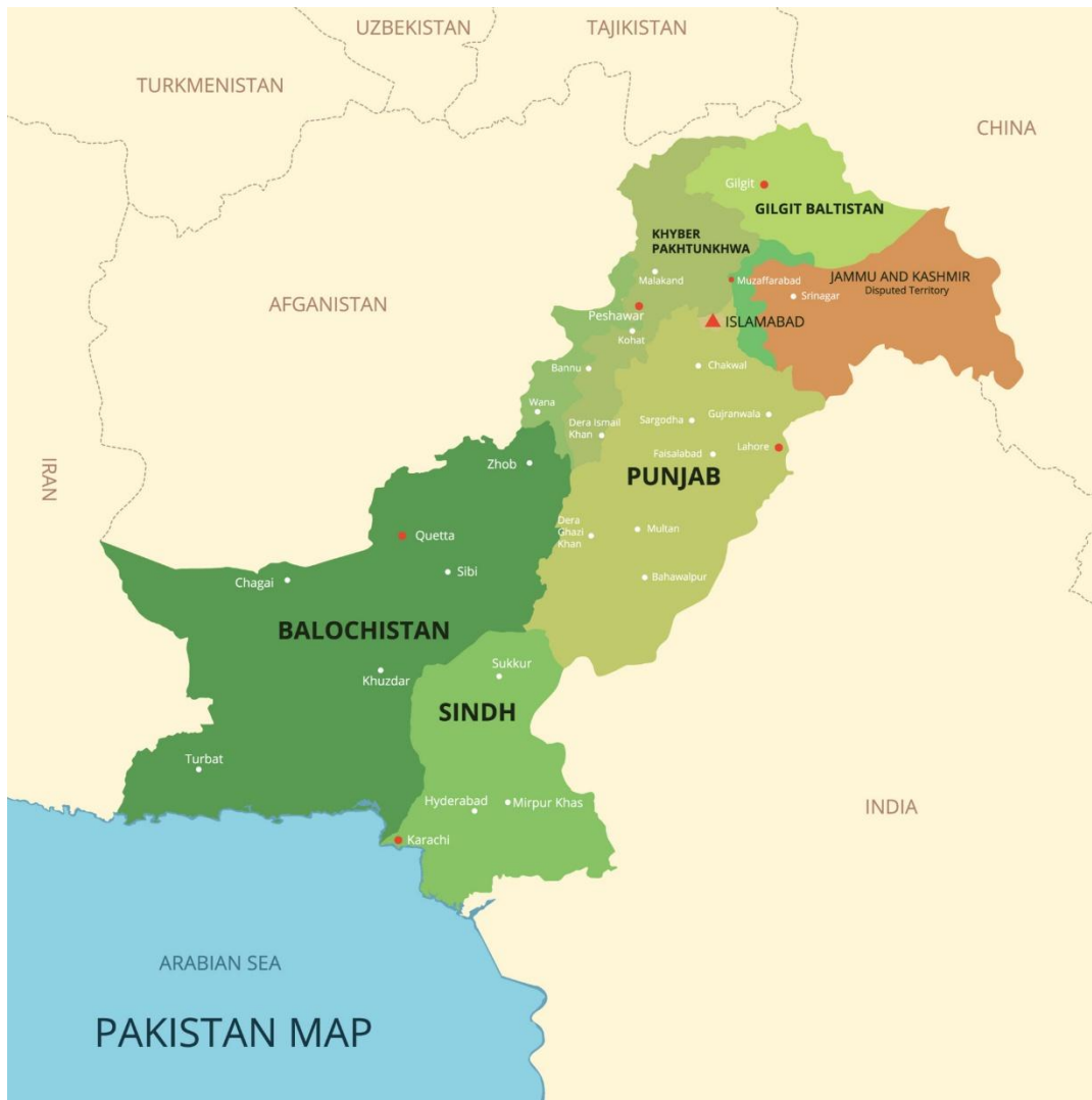
Theatre of operations · Islamabad to Karachi multi-city deployment

An Intelligence-Led, Discreet Protective Operation for a High-Profile International Executive Family